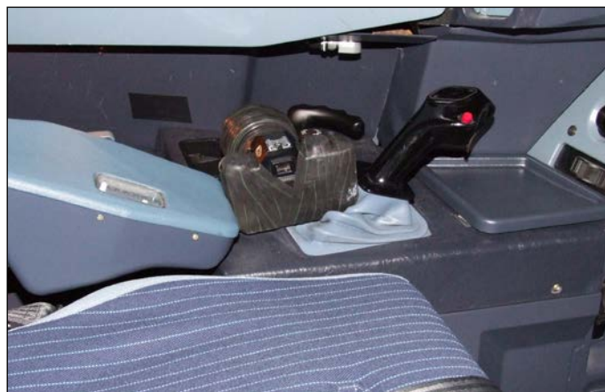
Figure 3: Re-construction of camera behind Captain's side-stick

Using the Voyager simulator, the team placed a copy of the camera between the armrest, which had been adjusted to the Captain's preferred setting, and the side-stick. When the seat was motored forward, the camera pushed the side-stick fully forward and became geometrically locked in place (Figure 3). The hand control base-plate was perfectly aligned with the position of the dent in the Captain's camera. The reconstruction took only a few seconds to set up and could be repeated time and again.