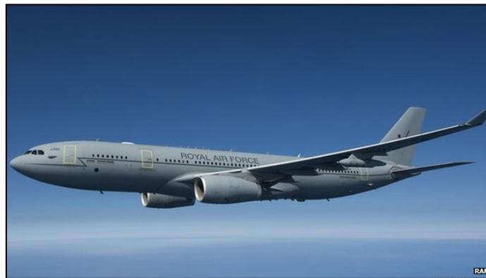
Figure 1: Airbus A330 Voyager aircraft