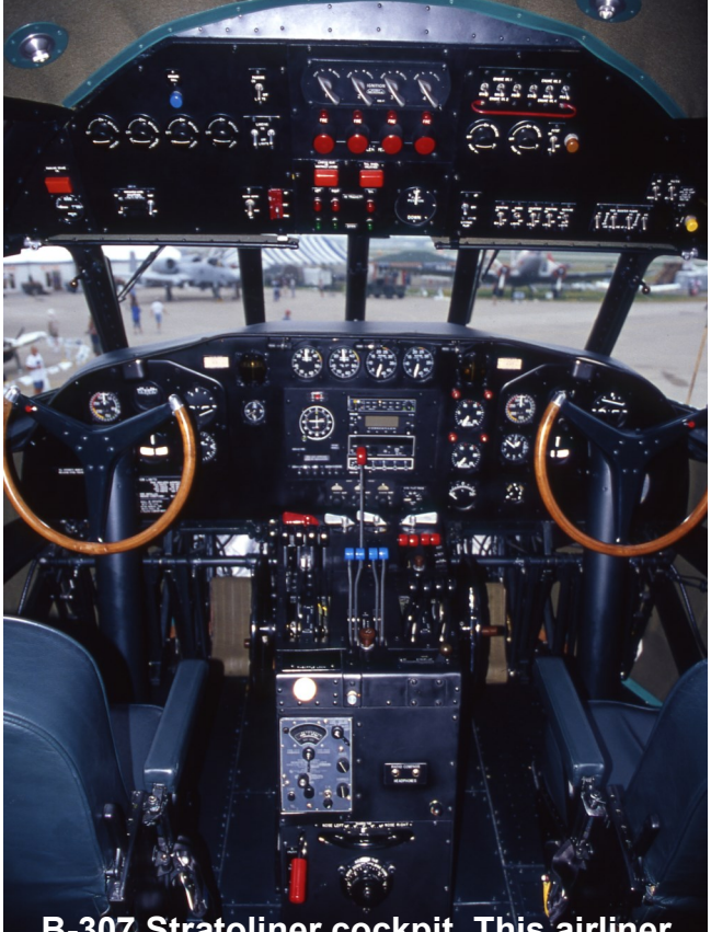
B-307 Stratoliner cockpit. This airliner is on display at the Smithsonian's Udvar-Hazy Center in PAA livery.

Registration will open in early 2016. Members are urged to save the date and plan to attend.